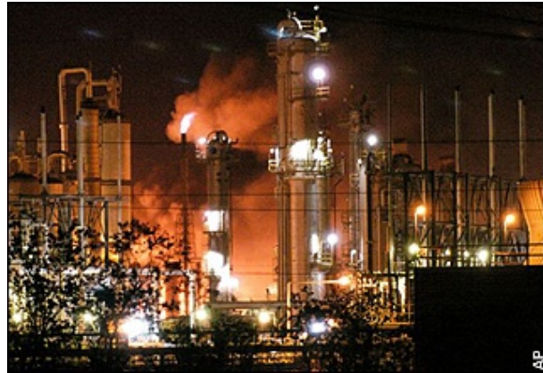
Texas City explosion March 2005

It's obvious that people do not deliberately set out to injure themselves or their fellow workers, however, their behaviour in the workplace is a manifestation of both their working environment and of the culture that they experience each day. If this environment does nothing to positively influence their behaviour then these potentially dangerous attitudes are likely to prevail and create a near perfect breeding ground for accidents.